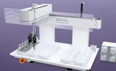
SEAL Minilab 1200

SEAL Robotic Minilab systems for automating sample (pre) treatment in the laboratory – improving your sample handling efficiency. Typical applications include BOD, pH, COD, Alkalinity, and conductivity measurements with options such as decapping/capping, sample splitting, and filtration. Call us about your laboratory needs and we will design a robot to suit you.